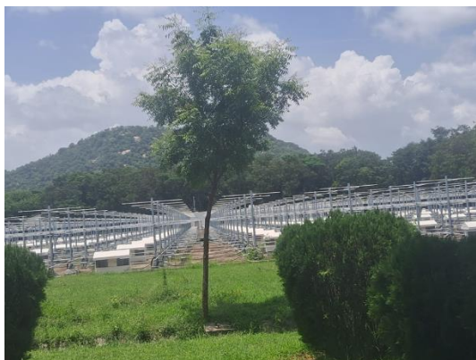
Places Visited in NARL:

NARL is an autonomous research laboratory fully funded by the Department of Space, Government of India and involved in carrying out fundamental and applied research in Atmospheric and Space Sciences. It had its humble beginning in 1992 as the National Mesosphere-Stratosphere-Troposphere (MST) Radar Facility. Over the years several complementary techniques such as Rayleigh/Mie lidars, wind profilers have been added. NARL is administered by a Governing Council with Secretary, DOS as the Chairman and Director, NARL as member secretary. The Governing Council sets broad policy guidelines for NARL. A Scientific Advisory Committee consisting of eminent scientists in the field of atmospheric science, monitors the research activities and progress of NARL and provides future directions.